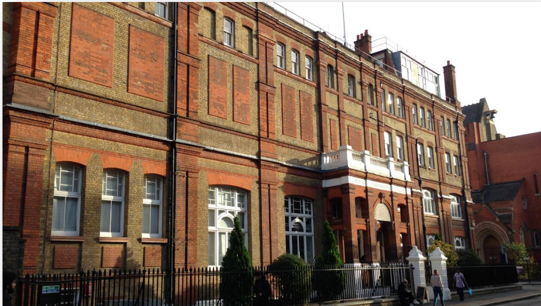
Garrod Building main Entrance.

For attendees unfamiliar with the area, please follow signs or ask locals for directions to the School of Medicine and Dentistry or the Dental Institute; both landmarks will lead you to the vicinity of the Garrod Building.